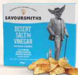
SAVOURSMITHS DESERT SALT AND VINEGAR BOXED CRISPS