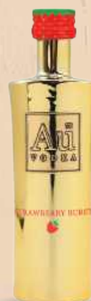
AU VODKA STRAWBERRY BURST