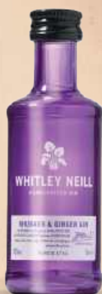
WHITLEY NEILL RHUBARB & GINGER GIN