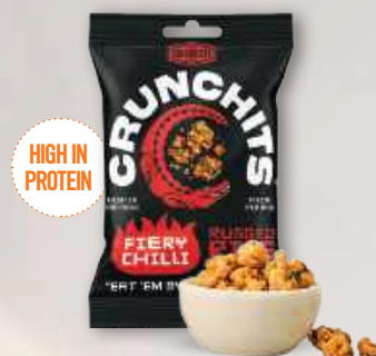
CRUNCHITS FIERY CHILLI RICE CLUSTERS