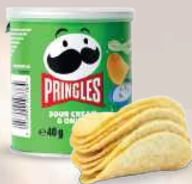
PRINGLES SOUR CREAM & ONION

Whether you're adding a snack to a meal deal or just fancy a delicious treat, we have a great selection for you.