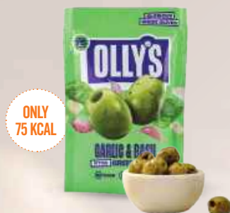
OLLY'S GARLIC & BASIL GREEN OLIVES