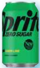
SPRITE ZERO SUGAR

Chill out with a refreshing soft drink, or mix with your choice of spirit from our selection.