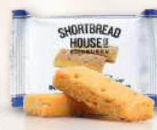
SHORTBREAD HOUSE OF EDINBURGH SCOTTISH SHORTBREAD