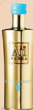
AU VODKA BLUE RASPBERRY