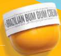
BRAZILIAN BUM BUM CREAM