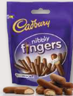
CADBURY NIBBLY FINGERS