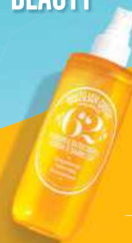
CHEIROSA 62 PERFUME MIST