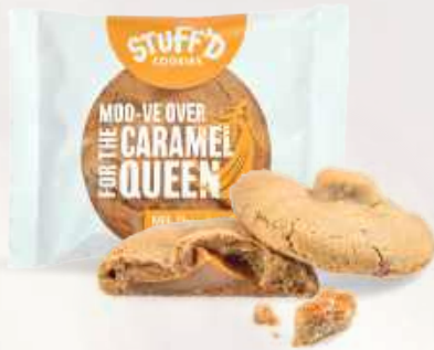
STUFF'D MILK CHOCOLATE CARAMEL COOKIE WITH GOOEY CENTRE