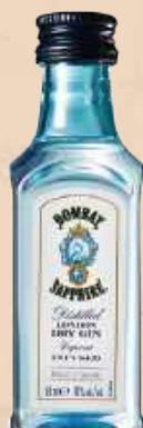
BOMBAY SAPPHIRE DRY GIN