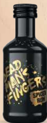
DEAD MAN'S FINGERS SPICED RUM