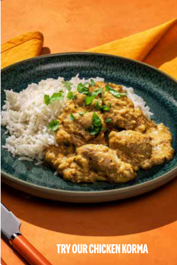
TRY OUR CHICKEN KORMA