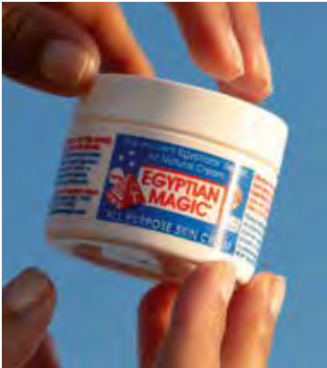
Egyptian Magic Skin Cream is a 100% natural, all-purpose cream to help soothe, hydrate and heal a range of skin concerns.

Its reputation spread through glowing reviews, celebrity love and backstage buzz, earning its place as a trusted skincare saviour. Plus, this iconic jar has become a travel essential for beauty lovers on the move thanks to its space-saving size. Why bring five creams if this one can do it all?